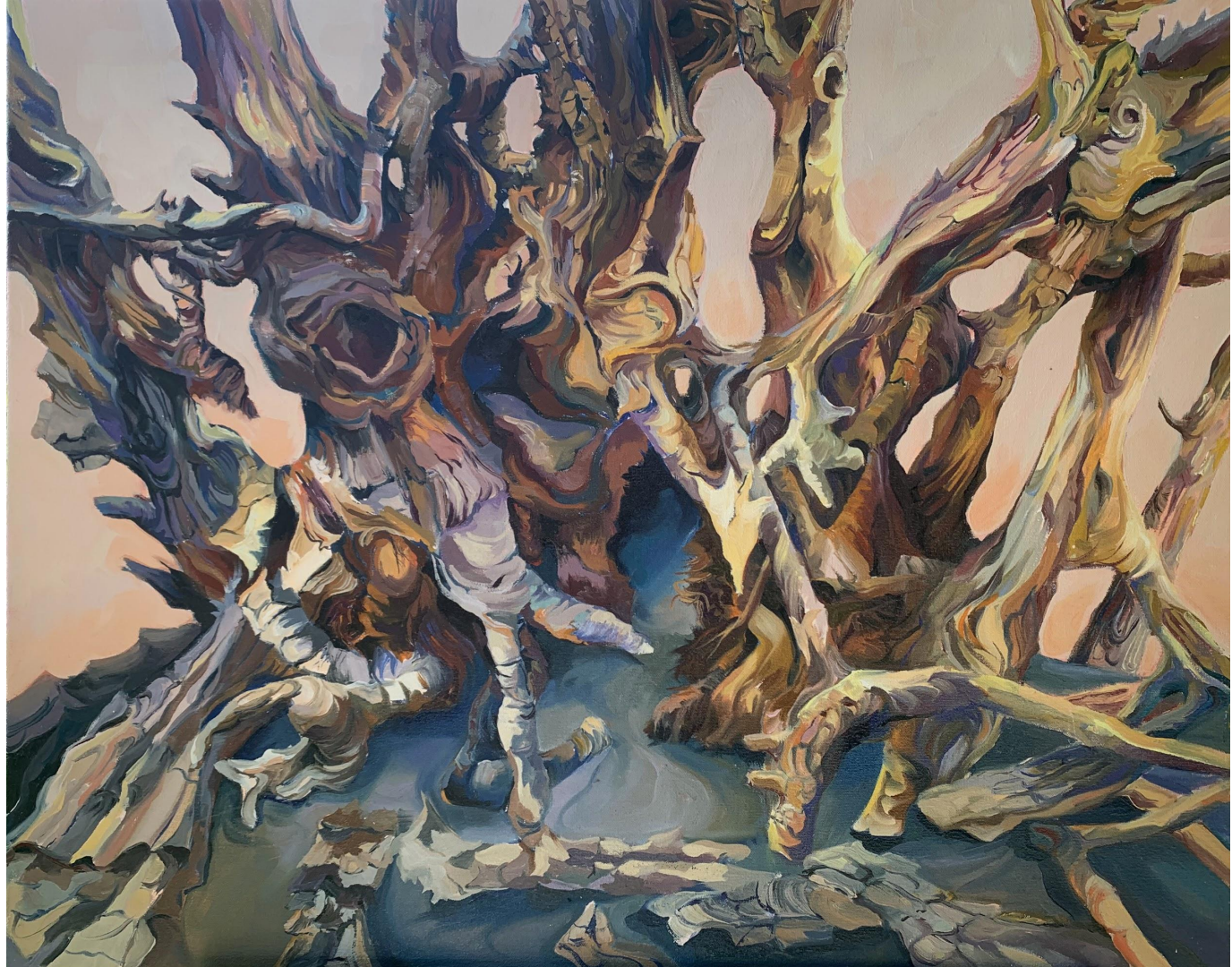
Roots 24"x30" Oil on Canvas 2020