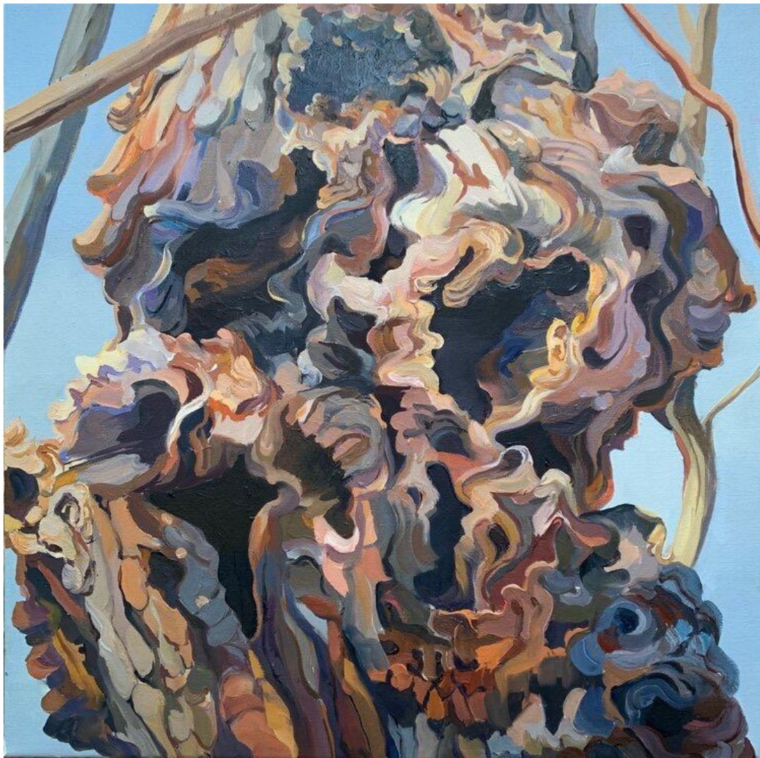
Tree Tumors 20"x20" Oil on Canvas 2020