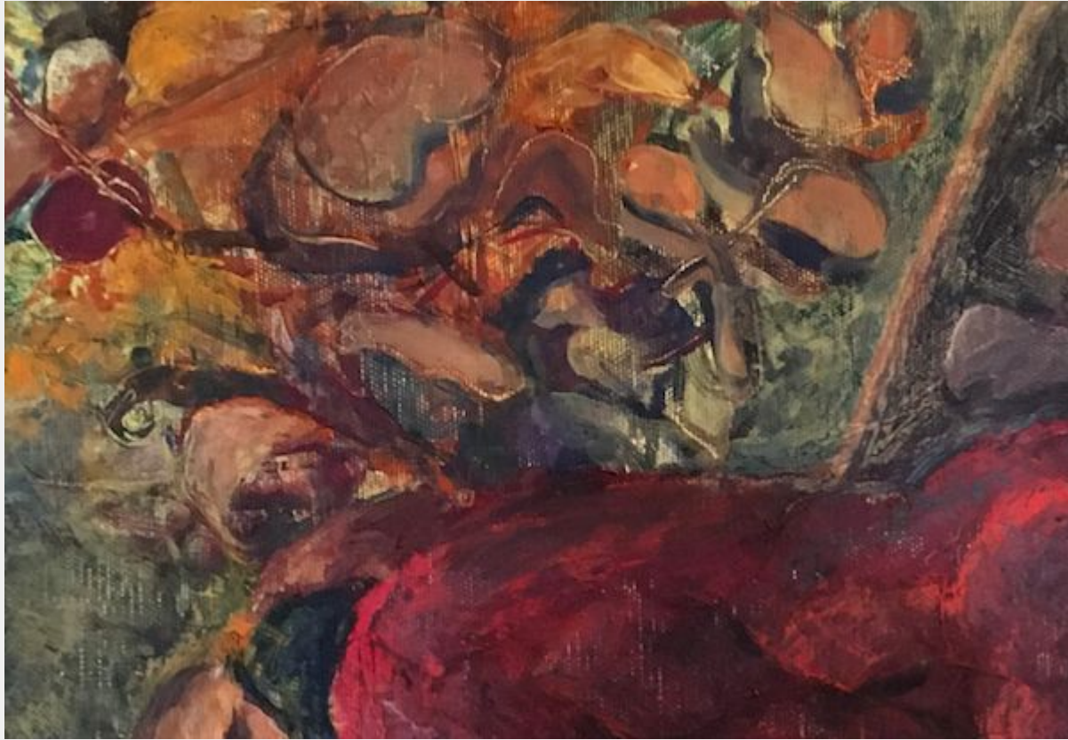
Red Coral Detail II