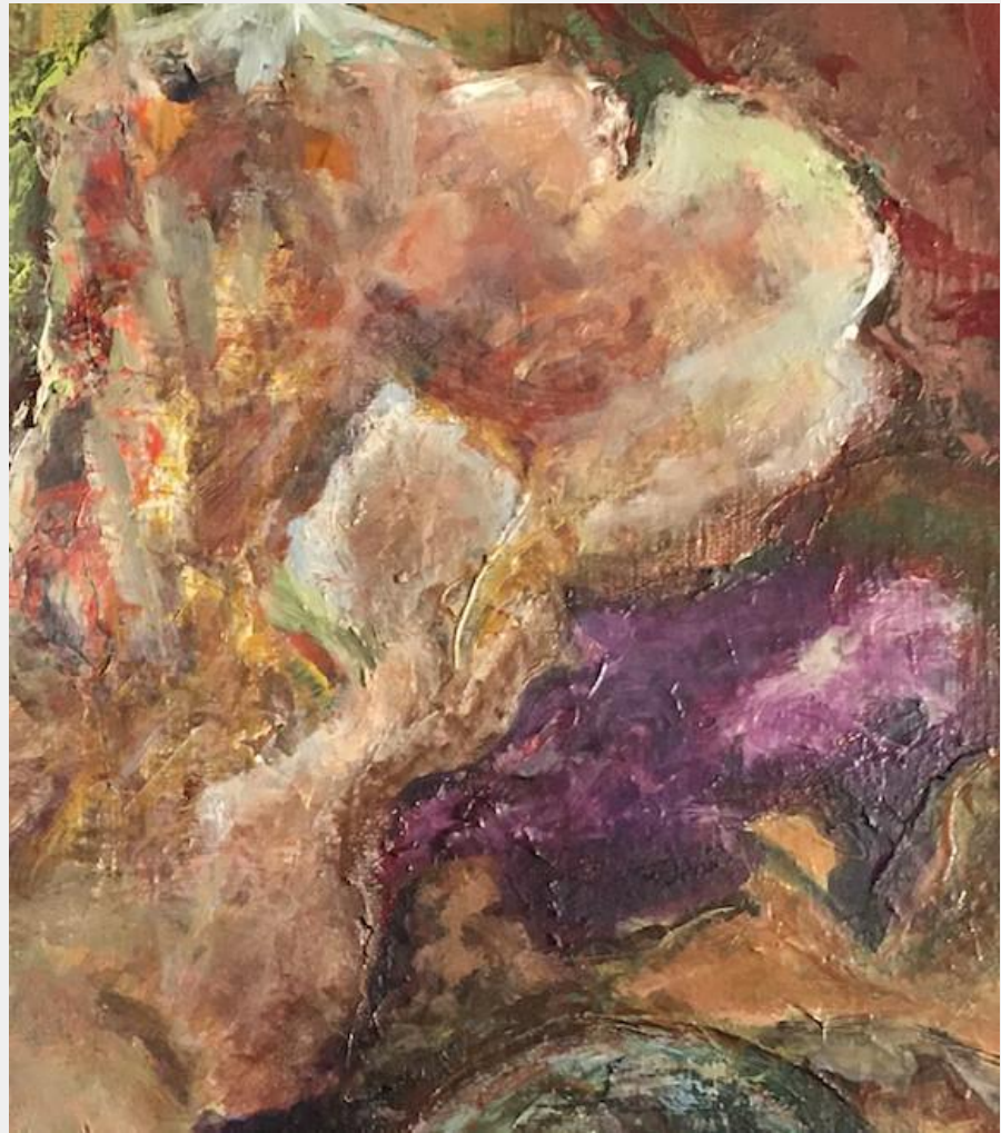
Fan Coral detail