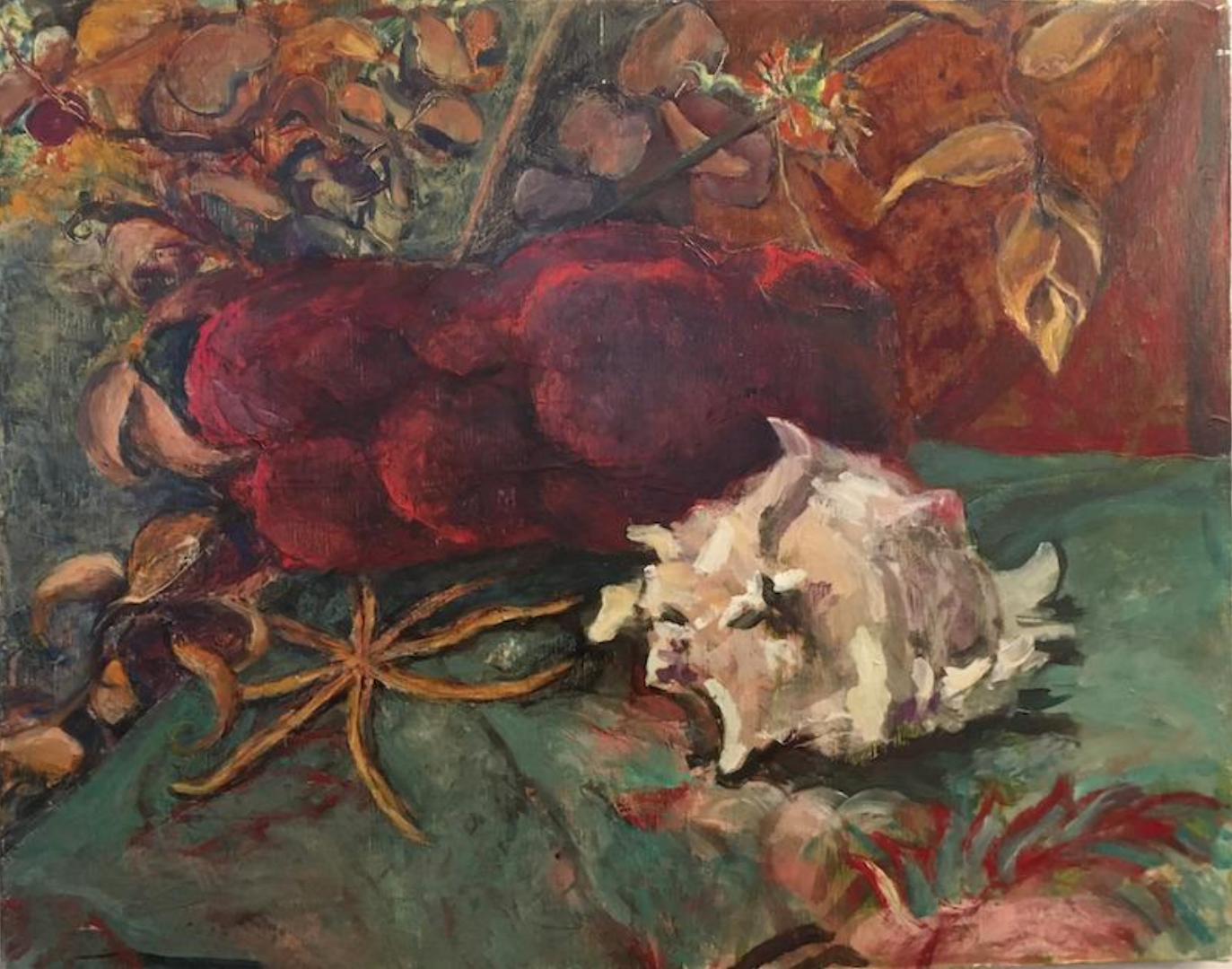
Red Coral 16" x 20" Oil on canvas