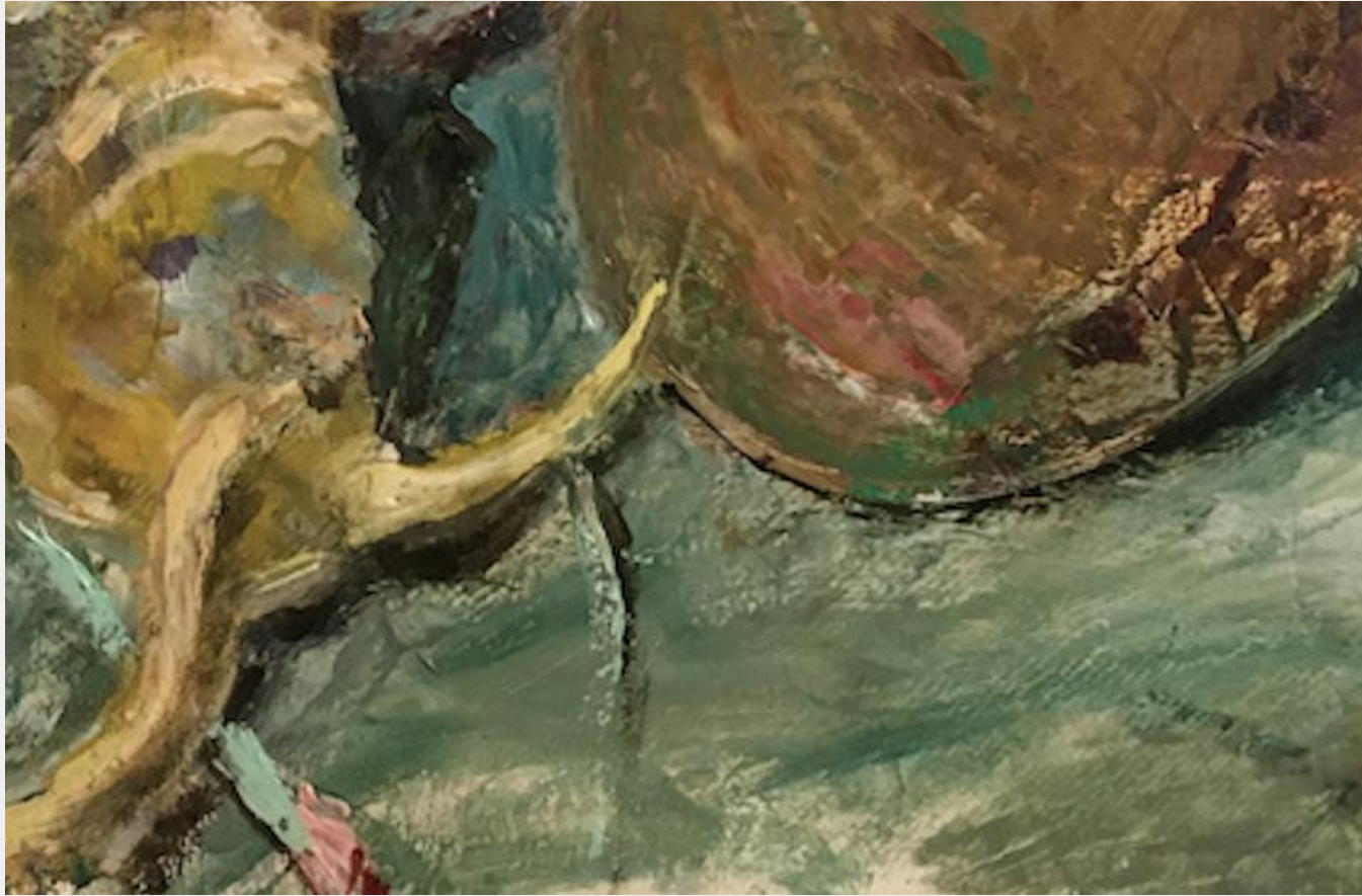
Spider Conch Detail II