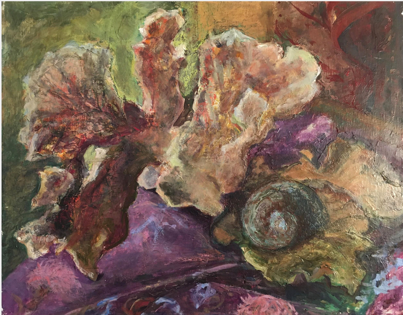
Fan Coral 16" x 20" Oil on canvas