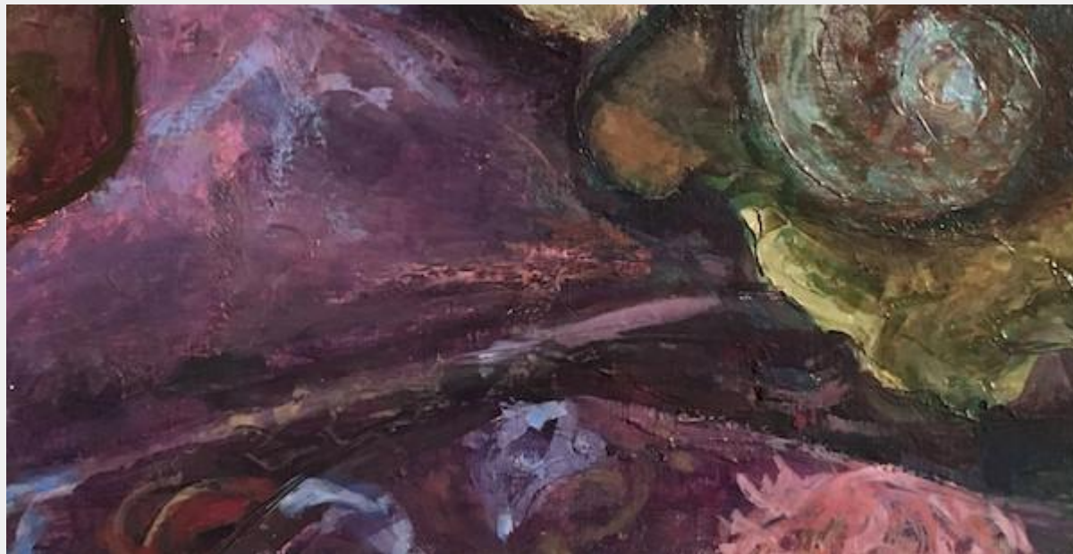
Fan Coral detail II