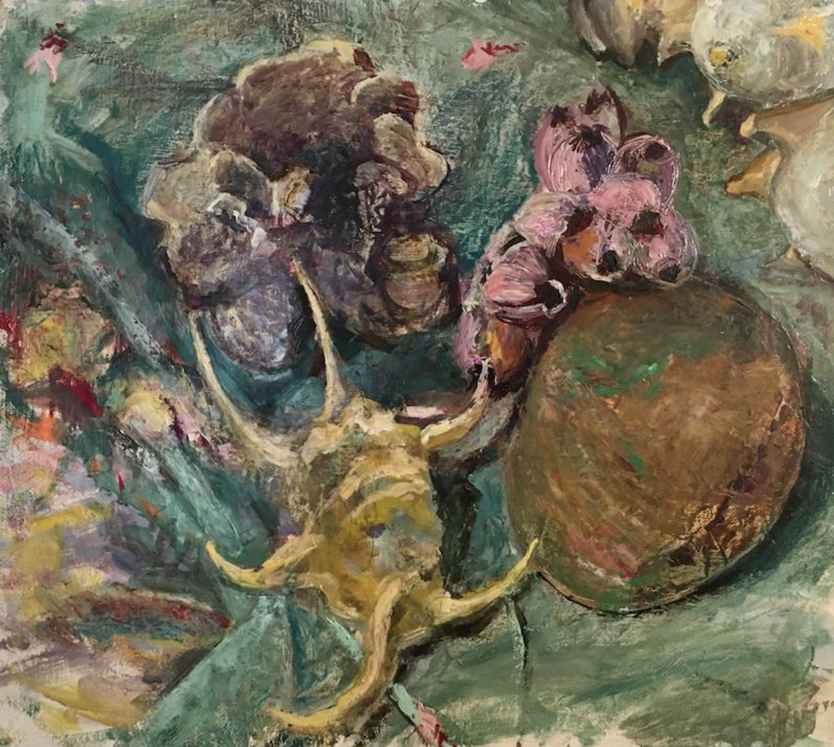
Spider Conch 16" x 18" Oil on linen