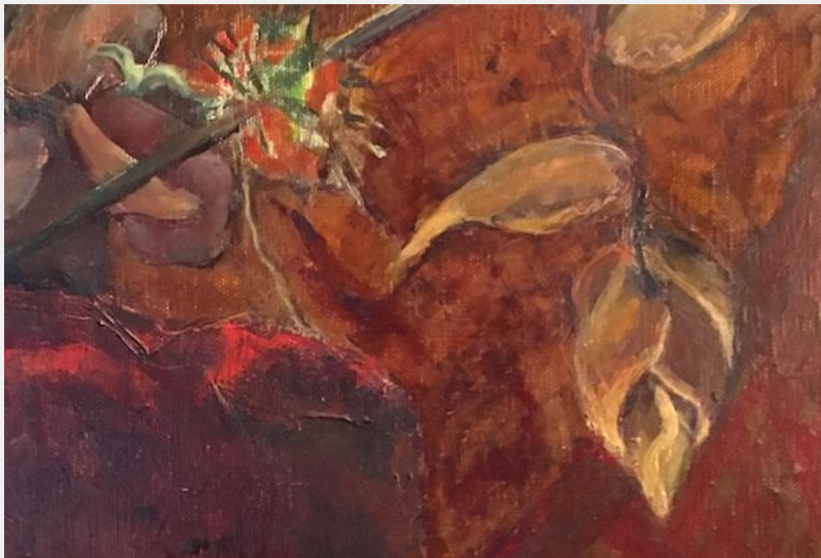
Red Coral Detail