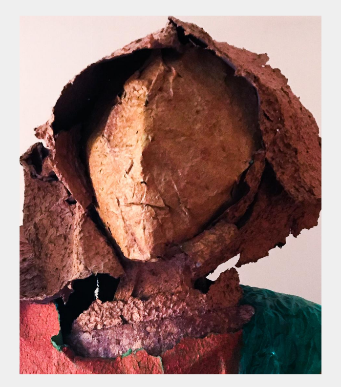
Head detail of "human I"