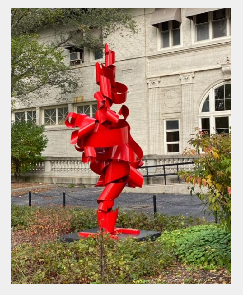
Red Ribbon, 11 ft x 5 ft x 5 ft, powder coated aluminum, 2017, Hamilton Park, Chicago