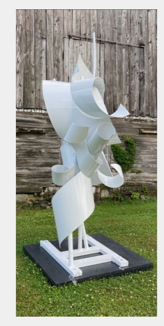
Wishbone 11 ft x 5 ft x 5 ft powder coated aluminum 2021