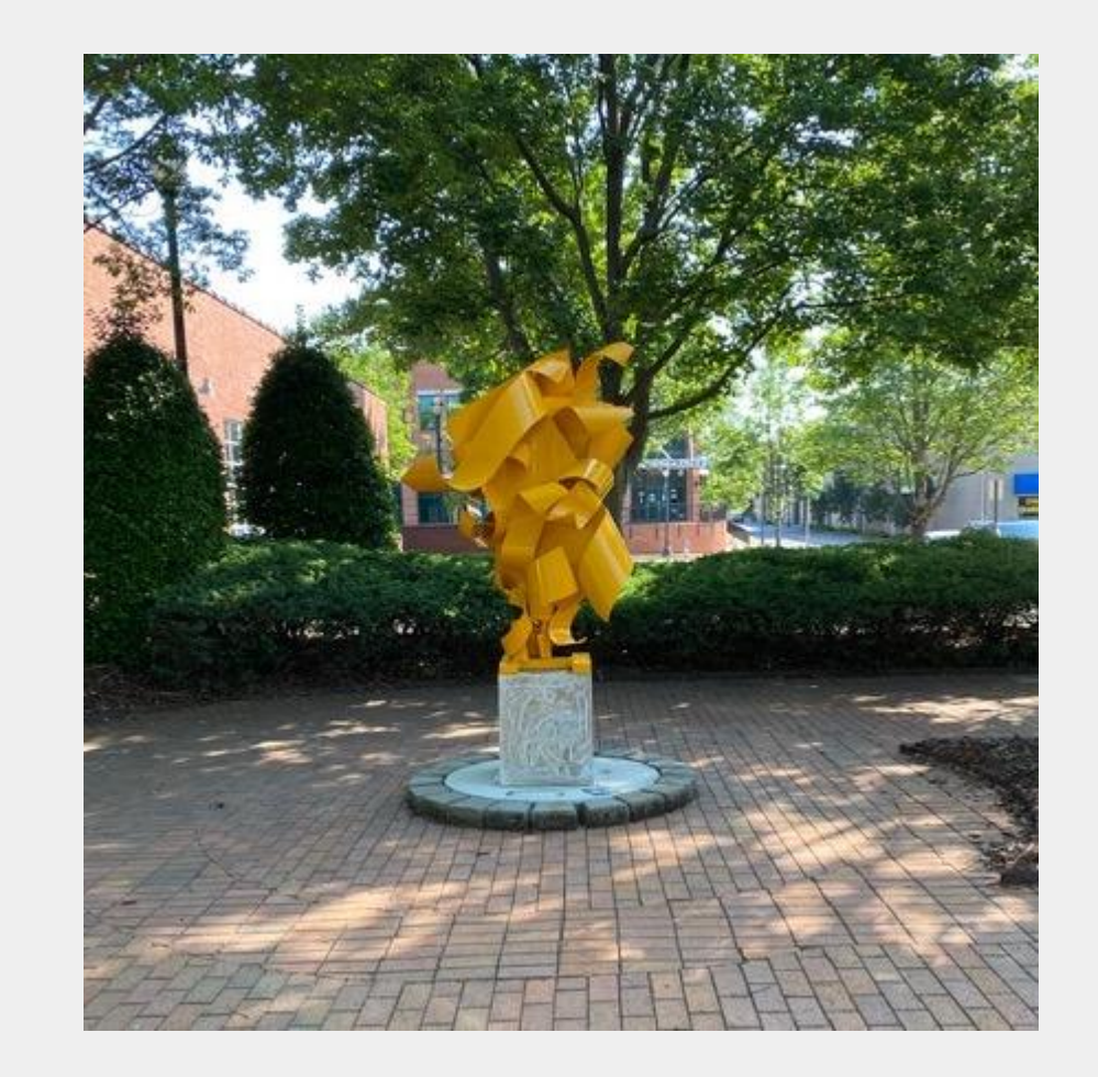
Gold Leaf 9 ft x 4 ft x 4 ft powder coated aluminum 2020, Salisbury NC