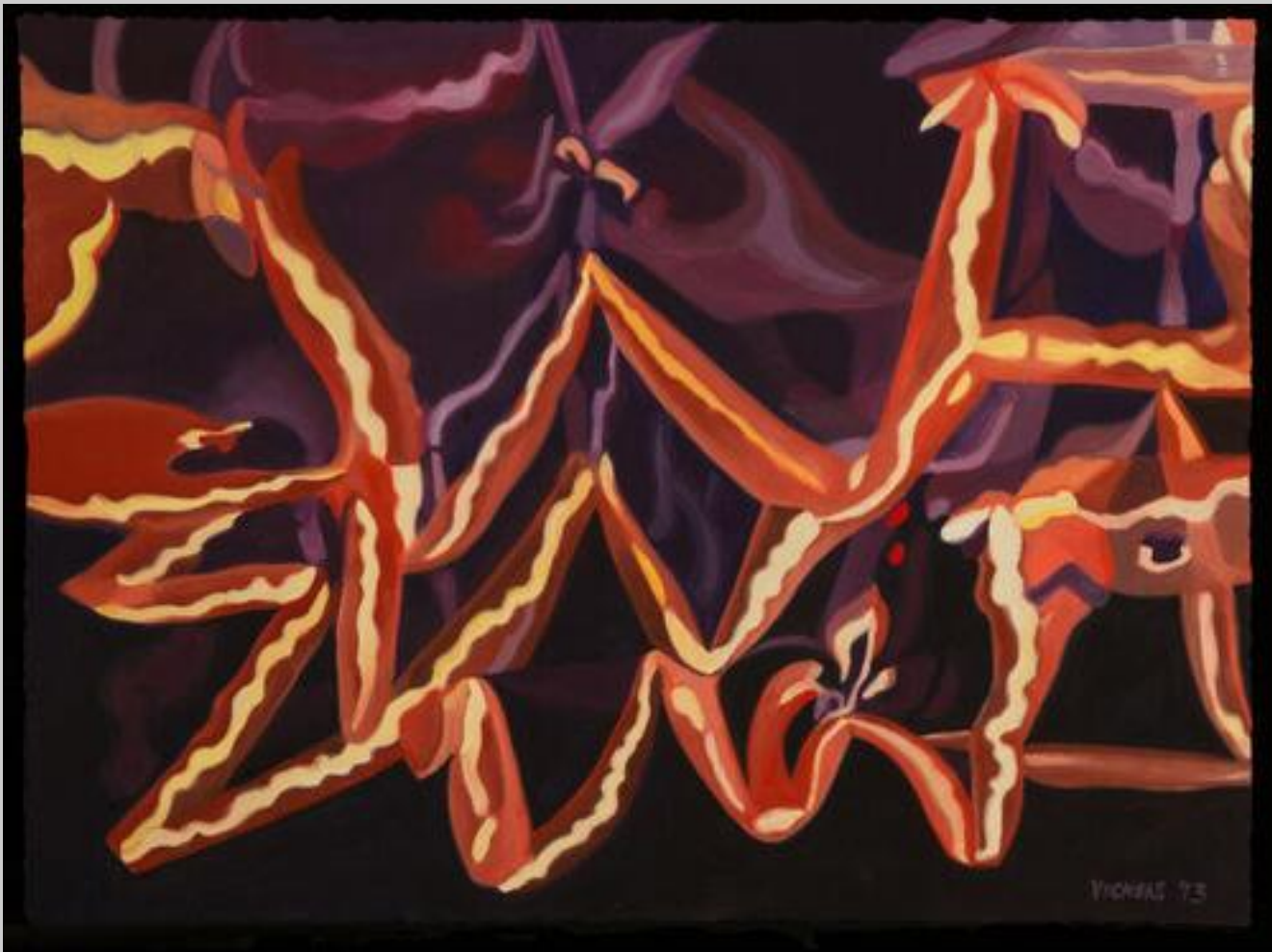
Lights in a Cave