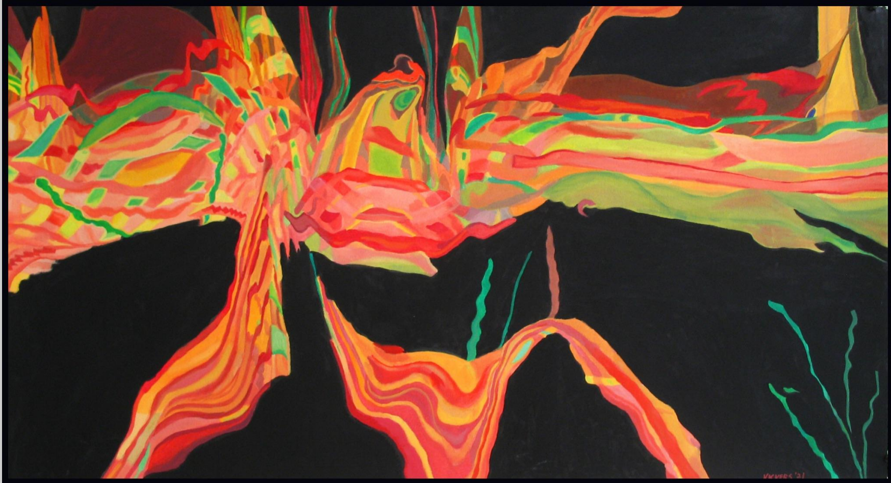
Stroll in the Dark