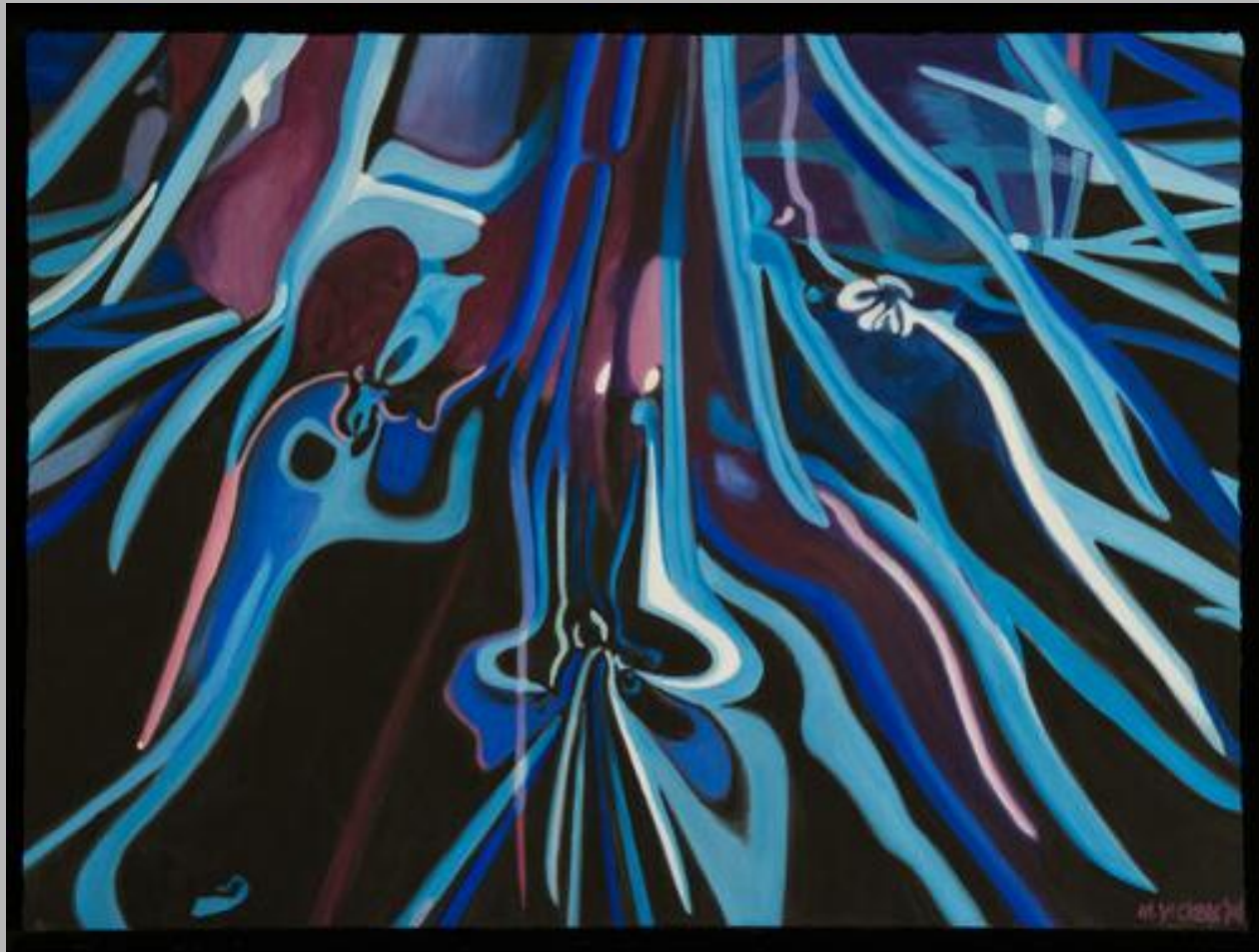
Hanging in the Sky